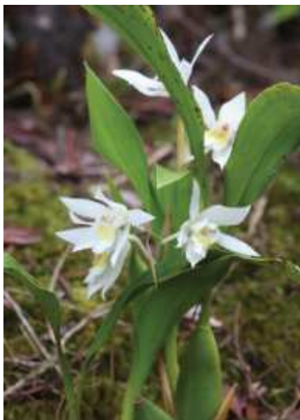
Coelogyne species, new wild orchid for Vietnam

WAR continues to conduct biodiversity surveys in Phu Quoc National Park in the period of 2010 to 2011.