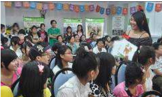
A nature game at the event (up) and university volunteer students of the project (down).

In this project, members of theme clubs and audience of Khan Quang Do magazine who are 12-15 years old, will experience and learn about wildlife rescue and nature protection through various creative and practical activities.