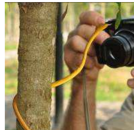
Survey in Vinh Cuu Nature Reserve

The specialists are working on the survey results to confirm the new species.