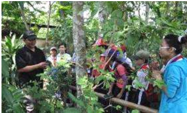
WAR staff introduces a rescue fresh water turtle

More than 30 students and teachers at Van Don Secondary School, Ho Chi Minh City visited Cu Chi WRS last May to learn about wildlife rescue and wildlife conservation. The students were excited to see the rescued animals, get to know about wildlife rescue, explore and learn about threats to wildlife and what they can do to help. In the afternoon, the students enjoyed wildlife games and signed a pledge canvas to commit on wildlife protection.