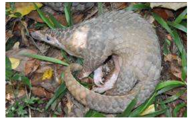
This Pangolin now enjoys her new free life at Lo Go Xa Mat forest, after staying at Cu Chi WRS for 3 months.

From Mar to June, more than 130 individuals of 22 endangered species have been released to the wild at Dong Voi Nature Reserve, Cat Tien, Lo Go Xa Mat, U Minh Ha and U Minh Thuong National Parks.